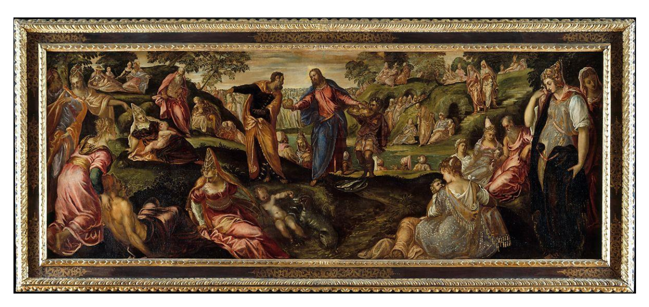
Jacopo Tintoretto, The Miracle of the Loaves and Fishes, ca. 1545-50

How could it occur in the reigning of God (βασιλεία τοῦ Θεοῦ) between the "already" and the "not yet"? We do not know, and do not have to know. However, it might happen, like with the miracle of the multiplication of the bread. Our task is to "seek first God's kingdom and his righteousness." (Mt 6: 33) The rest might be added. But beware, do not look for the living among the dead. (Lk 24:5)